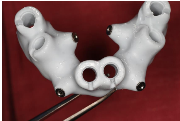
Figure 2. Surgical Guide

In navigated implantology, a more extensive and comprehensive diagnostic assessment is performed, allowing the clinician to fully consider the patient's individual anatomical features. During the preparatory stage, a three-dimensional model of the patient's dentoalveolar system is created, enabling the identification of the optimal implant placement site and the simulation of the surgical procedure in a virtual environment. To eliminate any potential intraoperative errors, all essential parameters — including the exact positioning of the implant — are transferred onto a customized surgical guide , which serves as the navigation reference during the actual surgery. This significantly accelerates the procedure, reduces the risk of complications, and ensures an excellent, predictable clinical outcome [8].