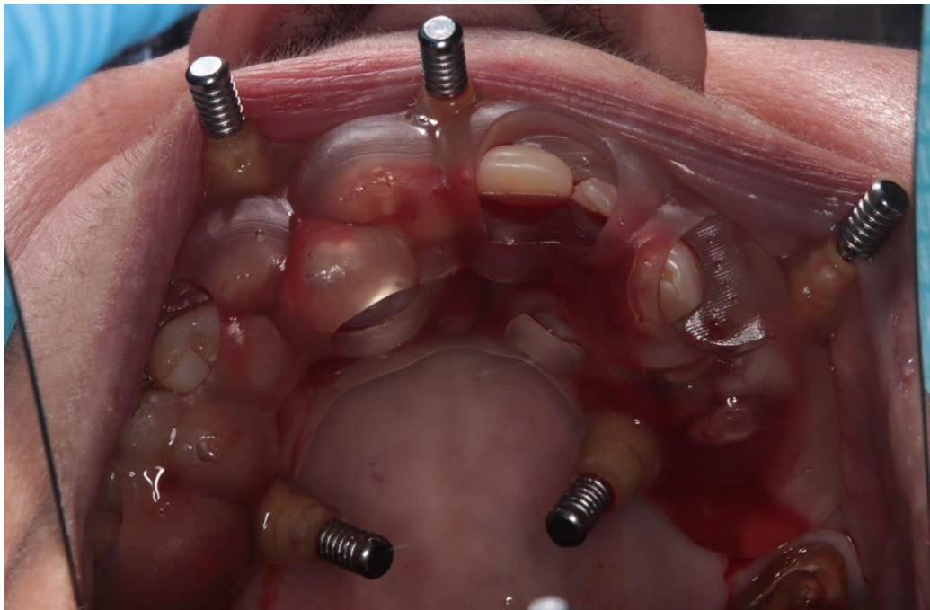
Figure 3. Surgical guides supported by remaining teeth